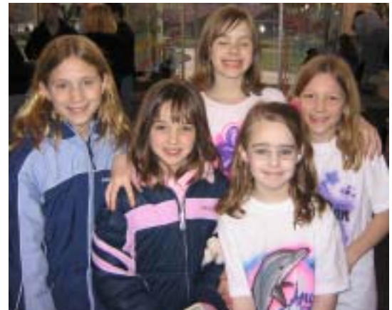
The suffering sisters....